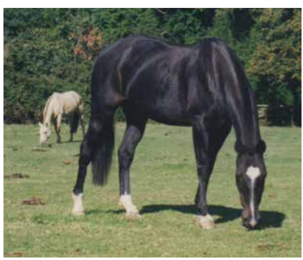
Gosh, the latest homebred addition to the school string